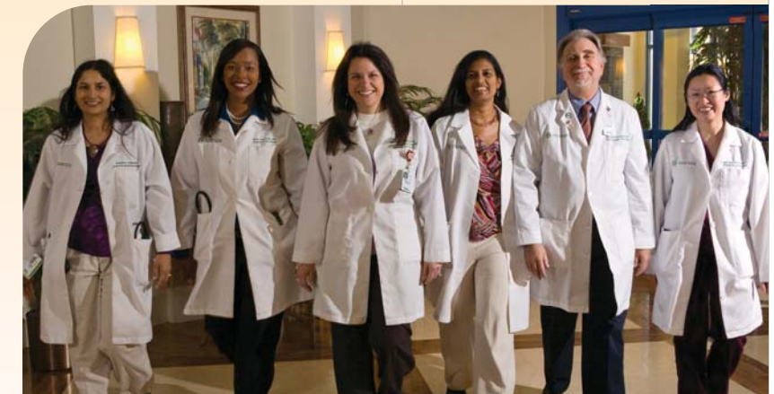
All LRCC physicians and surgeons take part in the weekly tumor board, including the women's cancer team (pictured here), urology, hematology and radiation.

Only at Lakeland Regional Cancer Center do you get the specialized attention of a tumor board. Our multidisciplinary team meets together weekly to discuss newly diagnosed cancer patients' individual conditions. Our board includes input from surgical, urologic, medical and radiologic oncology, as well as pathology. The group reviews all pertinent x-ray studies and pathologic slides, and a multi-disciplinary treatment plan is then derived specifically for each patient. It's a truly collaborative effort you'll find only at LRCC.